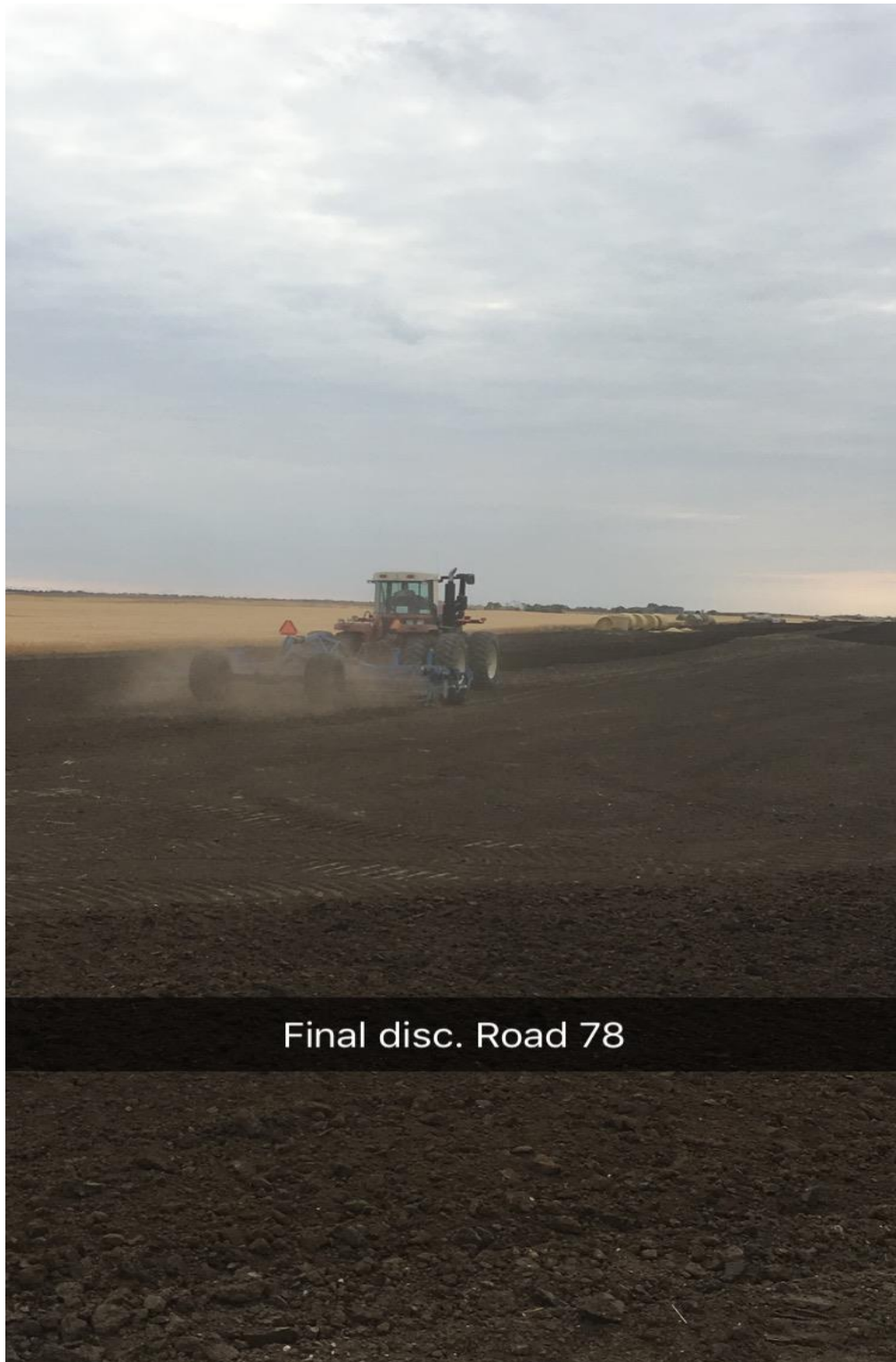
Final disc. Road 78