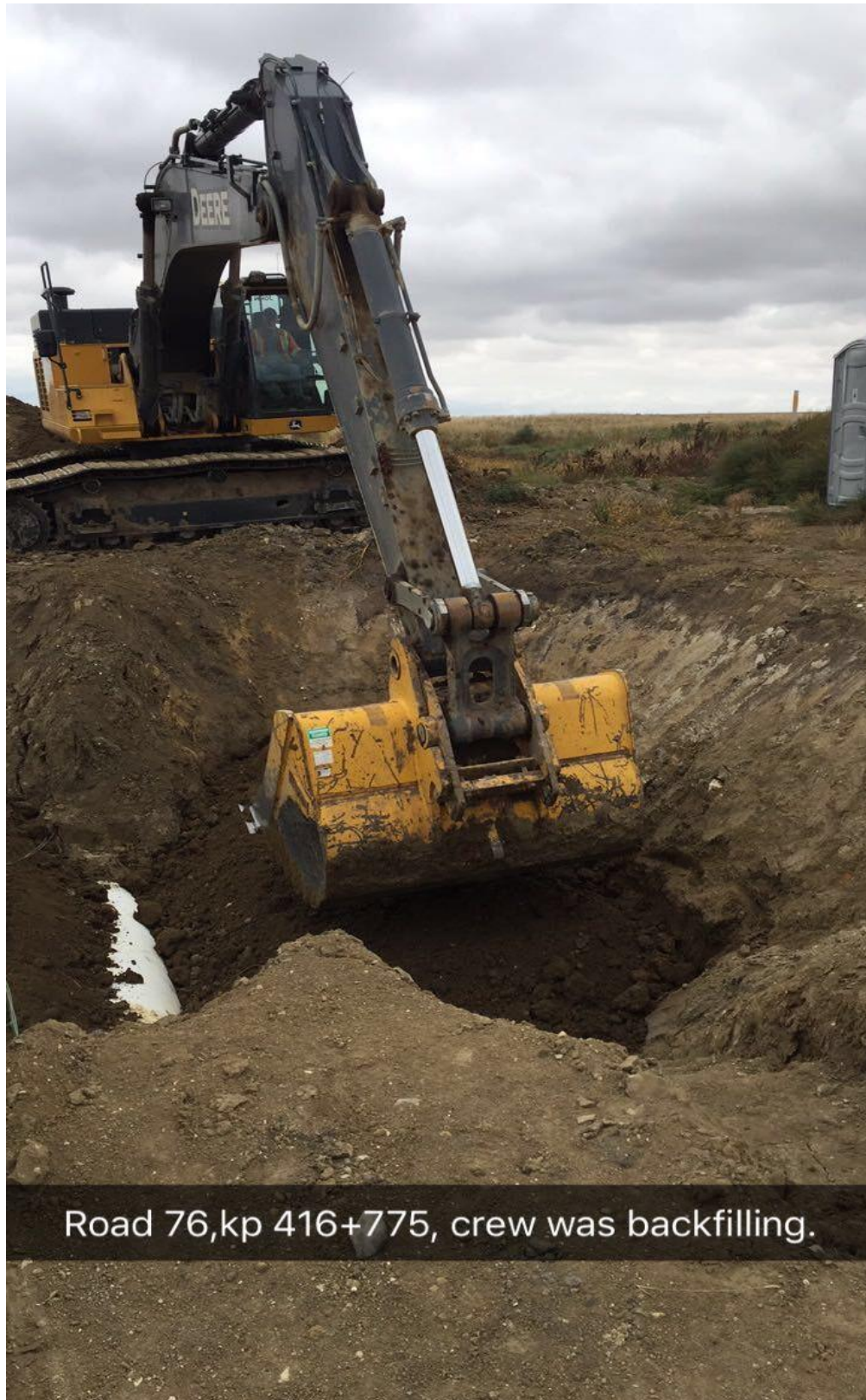
Road 76, kp 416+775, crew was backfilling.