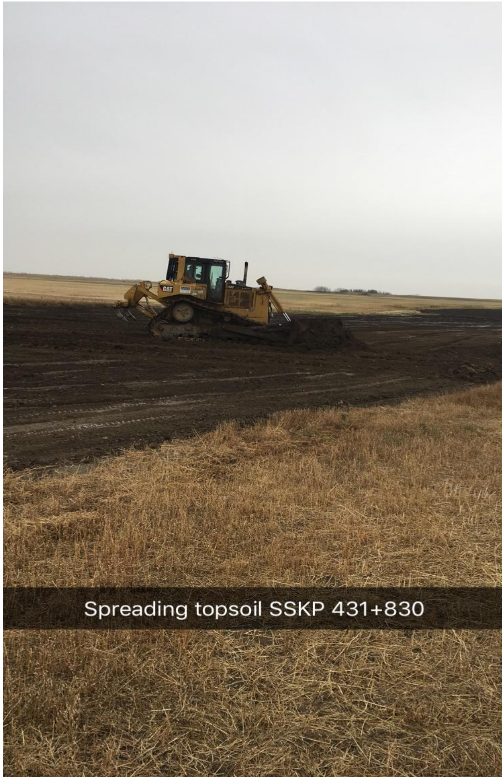
Spreading topsoil SSKP 431+830