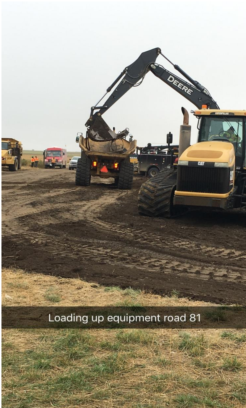
Loading up equipment road 81